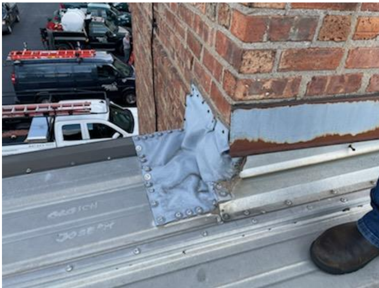
Chimney Flashing Reference in #4

BIDDERS ARE REQUESTED TO SIGN THIS FORM AS A FORMAL RECIPT OF THIS ADDENDUM AND TO RETURN IT WITH THE BID FORM.