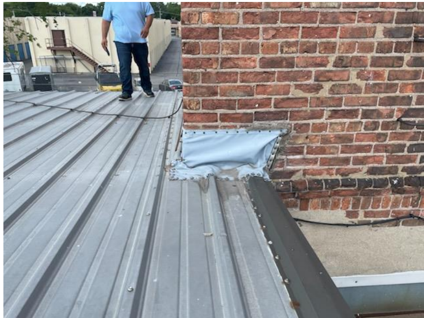
Chimney Flashing Reference in #4