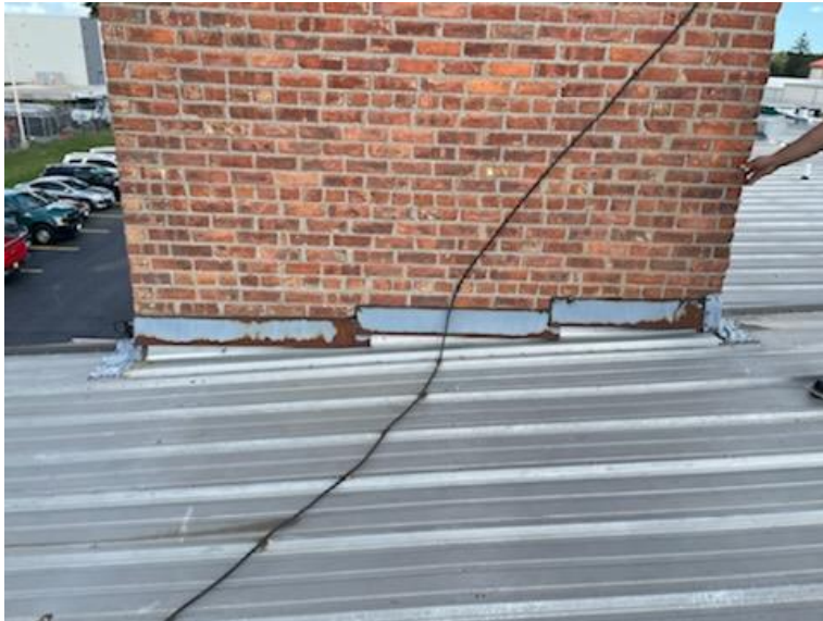
Chimney Flashing Reference in #4