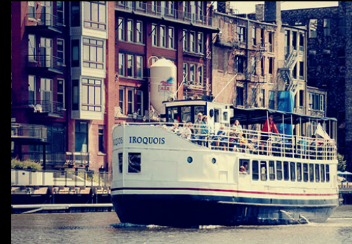
Milwaukee Architectural Boat Tour