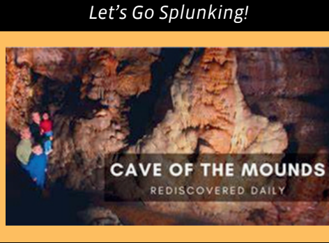
Cave of the Mounds