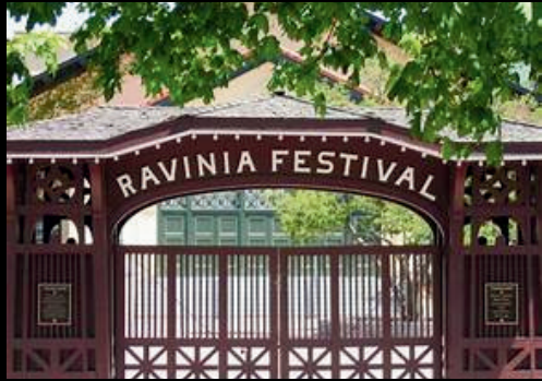
A Night at Ravinia